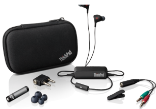
ThinkPad® Noise Cancelling Earbuds (0B47313)