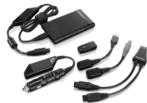
Lenovo® 90W Ultraslim AC/DC Combo Adapter and Lenovo® Slim Power Tip (41R44xx)