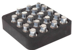
RK100 19 ID Coax Remote Set