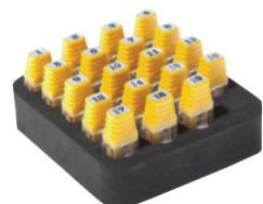
RK200 19 ID Network Remote Set