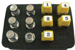
RK305 1-5 Network/Coax ID Remotes with F-Connector Coupler, F81