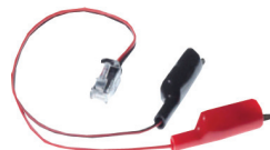
CA005 RJ45 to Alligator Clips