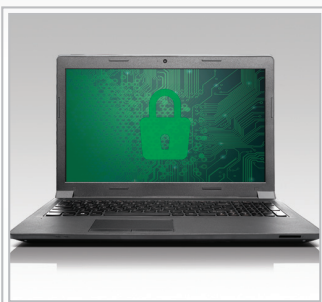
ROBUST SECURITY FEATURES