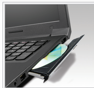
INTEGRATED OPTICAL DRIVE