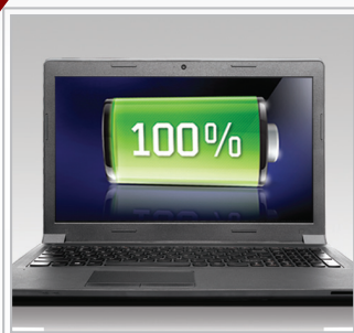
LONG BATTERY LIFE