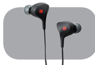
ThinkPad® Noise Cancelling Earbuds - 0B47313

Recommended accessory - power and dock your Laptop with one cable.