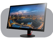
ThinkVision® Pro 2840m Monitor