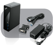
ThinkPad® USB 3.0 Dock 0A33970