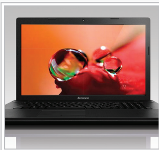
HD GRAPHICS SUPPORT