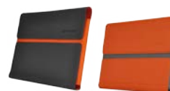
Fashion 8" & 10" Sleeve