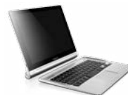
Bluetooth® KB Cover BKC600