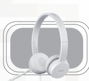
Lenovo 110 USB Stereo Headset