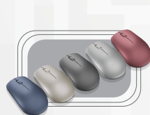
Lenovo 530 Wireless Mouse