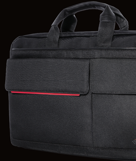
Lenovo Professional ▶ Topload Case