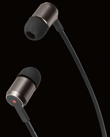
Lenovo In-ear ▶ Headphones