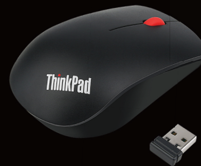
◀ ThinkPad Essential Wireless Mouse