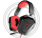
Lenovo Y Gaming Stereo Headset

* Example of Lenovo Legion catalogue naming convention