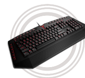
Lenovo Y Gaming Mechanical Switch Keyboard