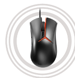
Lenovo Y Gaming Optical Mouse