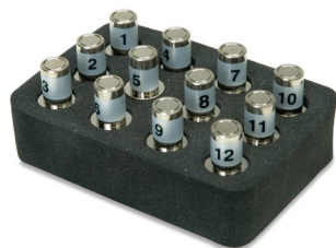
12 ID Only Coax Remotes