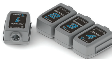
4 Coax RF Remotes