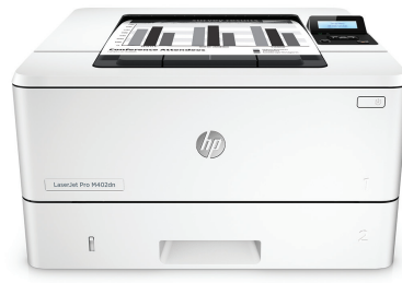
HP LaserJet Pro M402dn

Printing performance and robust security built for how you work. This capable printer finishes jobs faster and delivers comprehensive security to guard against threats. 1 Original HP Toner cartridges with JetIntelligence give you more pages. 2